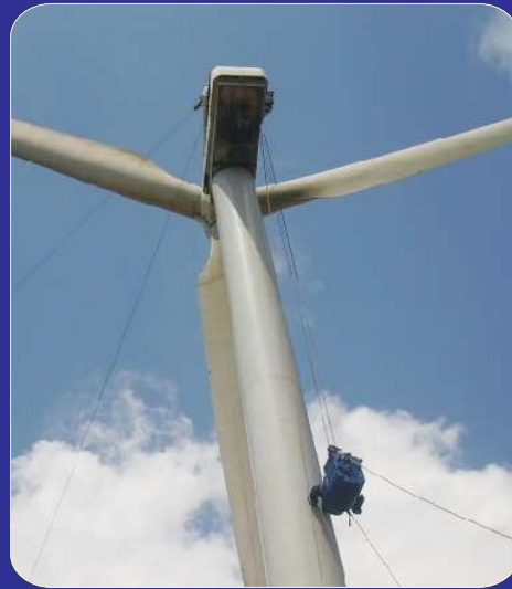
NEG-Micon, 950KW Gearbox.