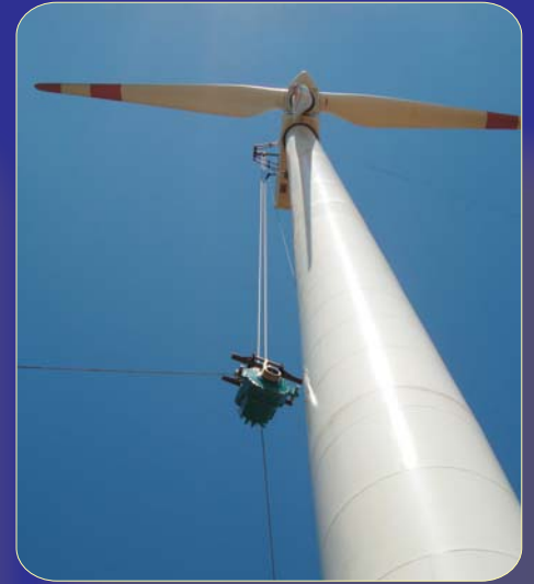
Suzlon 1.25 MW Gearbox