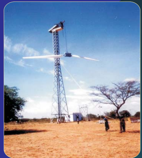
Das Lagerway, 225-KW Rotor.