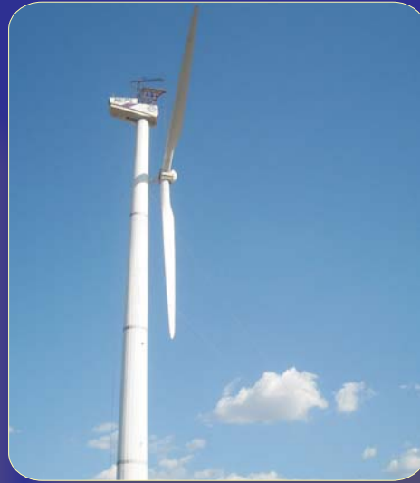
NEPC make, 750KW Rotor