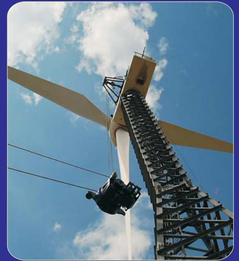
Vestas RRB 500 KW Gearbox.