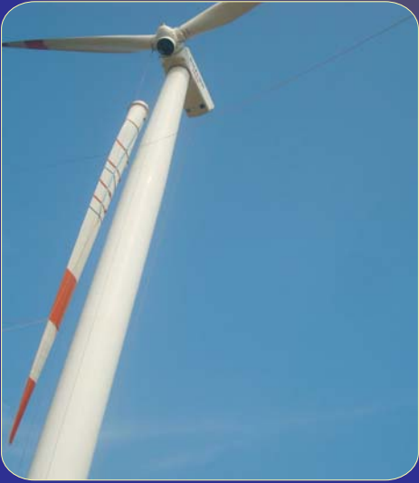
Suzlon make, 1.5 MW Blade.