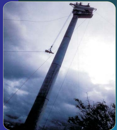
NEPC - Main Shaft replacement.