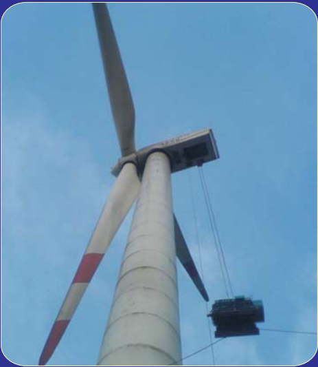
Suzlon 1.25 MW Generator.