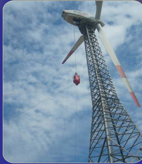
Suzlon make, 1-MW Gearbox.