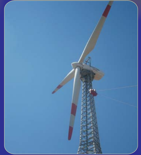
Suzlon 1-MW Generator.