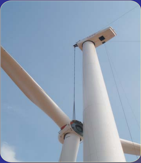
Suzlon make, 1.25 MW Rotor